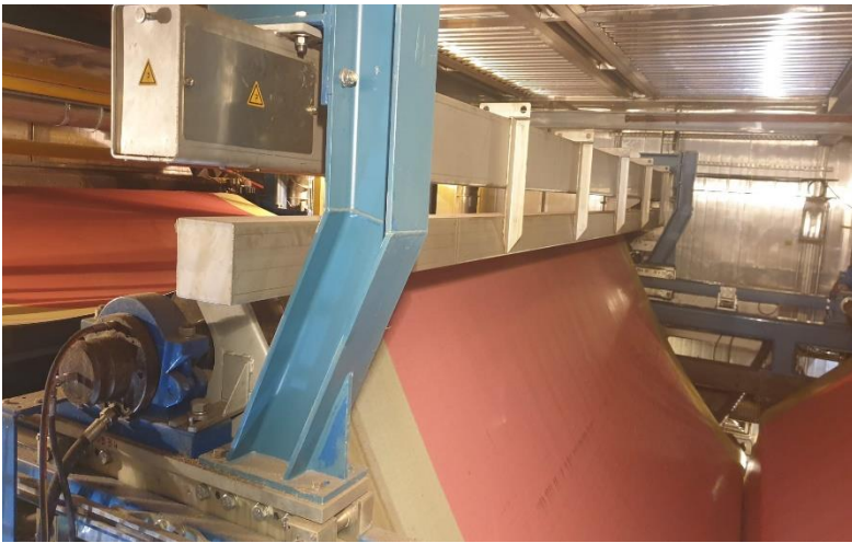
PCF DRYERFABRIC CLEANER INSTALLED ON TENSIONER

Recently PCF Maintenance bv has installed a new PCF Dryerfabric cleaner with great success at Smurfit Kappa Roermond Paper PM 3, The Netherlands.